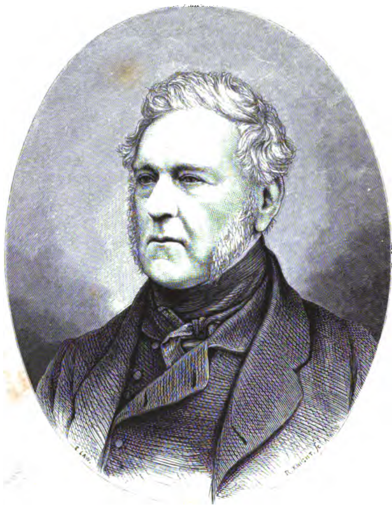
THE HON. ADMIRAL ROUS.